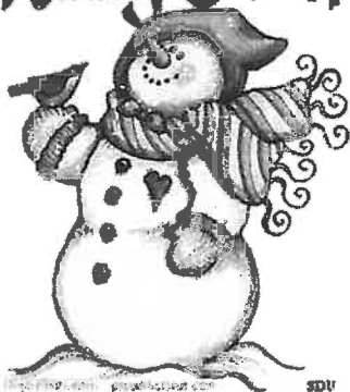
Illustration by: [unreadable] SDU