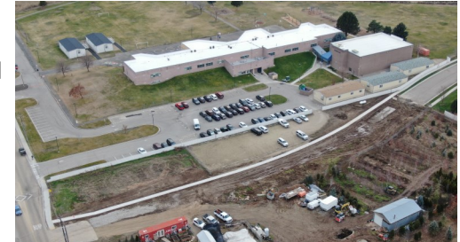
Sidewalk Constructed with Child Pedestrian Safety Funds

Thank you Idaho for investing in Middleton.